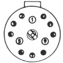
FRONT VIEW XSL-12-CCP-PBOF 12 { 3# 16 AWG 9# 20 AWG

Note: Recommended Tubing Size: .75 ID Tubing not supplied with parts unless specified.