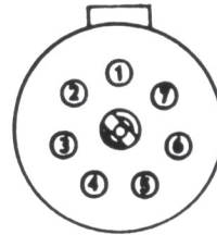
FRONT VIEW XSL-7-CCP-PBOF (7# 16 AWG)