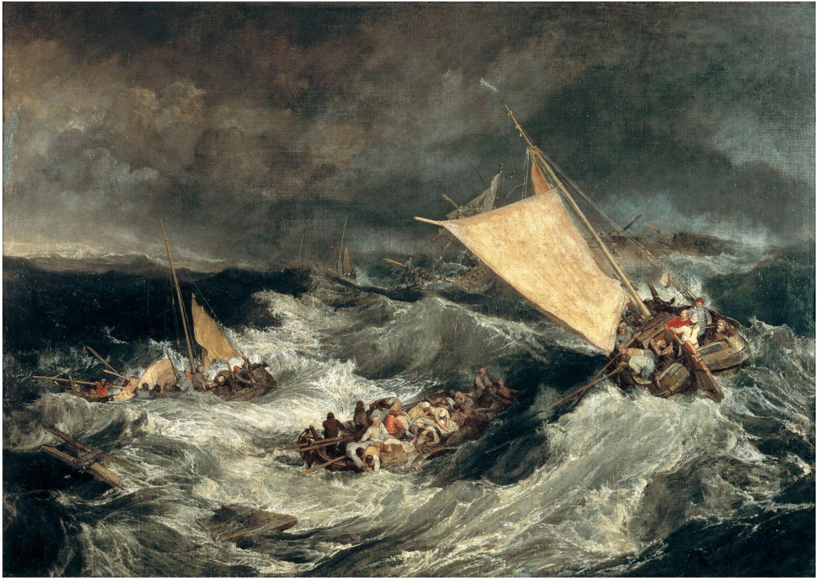
J.M.W. Turner 1805