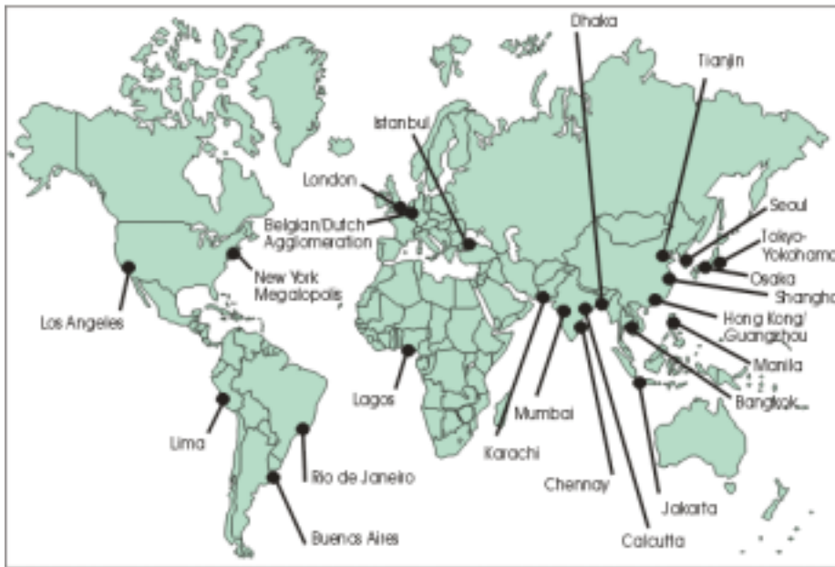
FIGURE 1 Very vulnerable areas of the World (Populated Deltas)