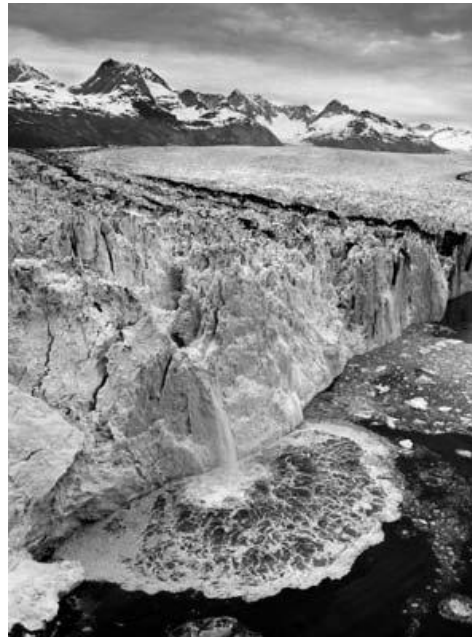
While the disintegrating Columbia Glacier in Alaska is adding to ocean levels this century, the total global sea rise by 2100 may be lower than some are anticipating, according to a new University of Colorado at Boulder study.

"For Greenland alone to raise sea level by two meters by